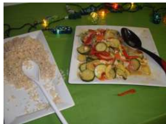
Healthy snacks prepared by Newberry residents during the program