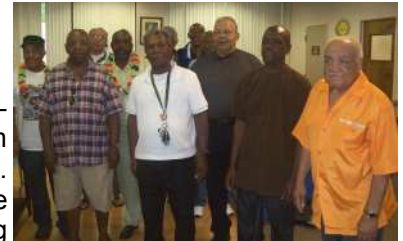
North 25's men are honored with a Father's Day Cookout

Just recently, in June, North 25 honored the men of North 25 Housing with a delicious Father's Day Cookout and cake.