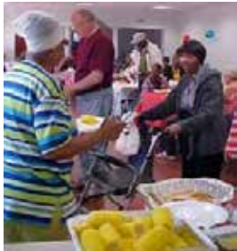
Baltic Plaza residents enjoy the Memorial Day festivities

So when Baltic Plaza planned their Memorial Day Celebration,