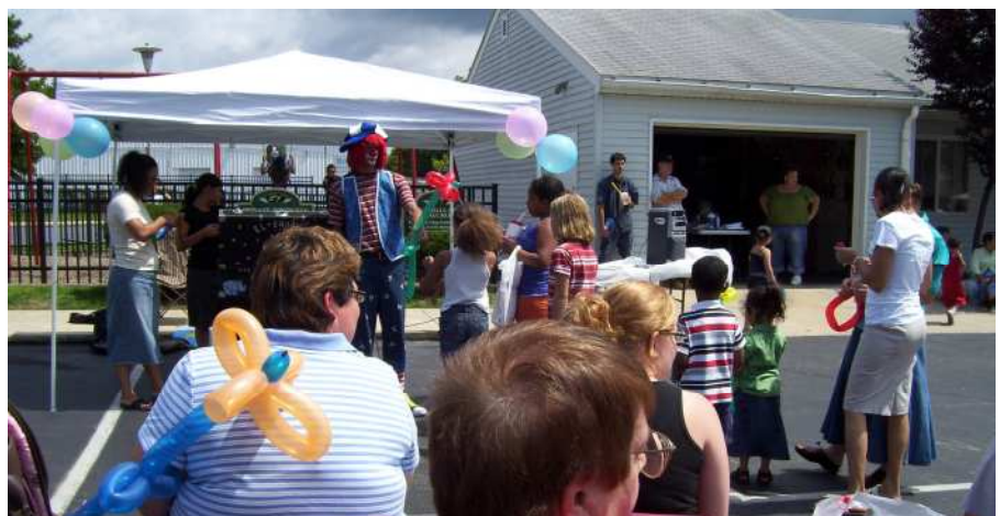
Lebanon Village residents enjoy the entertainment provide by Nanito the Clown

At least a dozen local agencies provided services, information, and registration. Kaplan Career Institute performed free blood pressure testing for attendees, and Sycamore Springs Orchard brought local fruit for sale and accepted WIC (Women Infant and Children) coupons from residents. Lebanon Village staff cooked hot dogs on the grill and served food and drinks to resi-