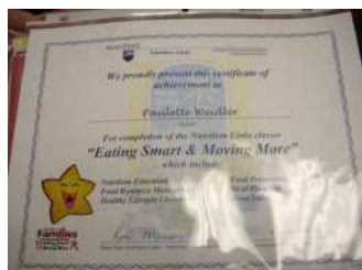
Certificate received by participants in the Nutrition Links program

learn new techniques, but they forged friendships that they probably would not have otherwise made. Tuesday July 5, 2011 was their