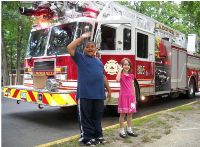
Children at Browns Woods enjoy the chance to explore a real fire engine

Sirens rang from two fire engines throughout Lawrence Drive, alerting our residents that the time had approached for the live demonstration from the local fire department. Ten firemen shared the importance of each item located on the fire engine and explained its use. The children gleamed with amazement at the size of the