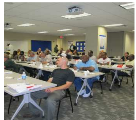
CRM's Superintendents' attending on of the many sessions held in Marlton