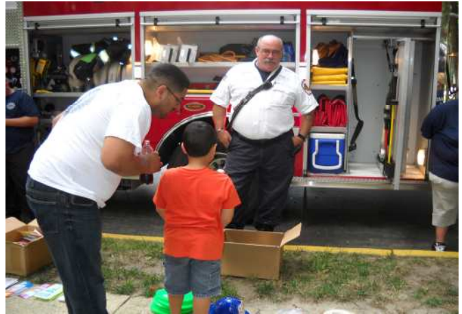
Browns Woods residents participate in their annual Fire Safety Event

truck and authenticity of the sophisticated equipment.