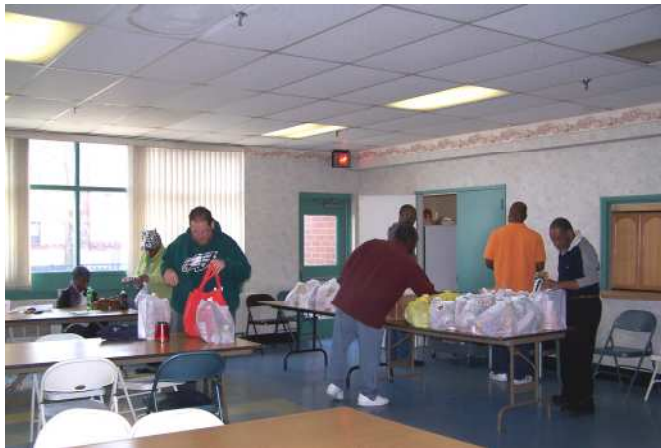
Volunteers and workers help to prepare grocery bags at the New York Avenue Food Pantry