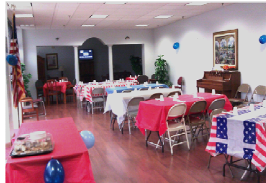
Baltic Plaza's community room was decorated in a patriotic theme for Memorial Day