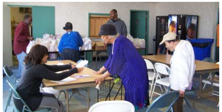
Residents register for the New York Avenue Food Pantry

Food distribution started in January, and since that day, a growing number of community members have benefited from The Food Pantry. Currently our Food Pantry serves about 65 people monthly, with residents from New York Ave. Apartments, Baltic Plaza and Atlantic City Townhouse receiving the benefits of the program. Our intent is to continue to grow and meet the needs of more residents in the community.