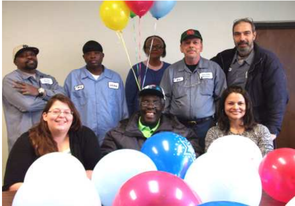
The Luther Arms' team celebrated their success with the resident that helped them reach their goal!

On March 30, 2011, one day early of their goal, Luther Arms became 100% occupied and kept their promise to the Board of Directors. CRM management and Luther