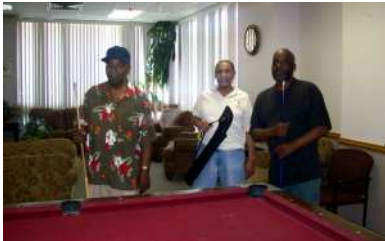
The North 25 Champs practice their best shots in preparation for competition

Vice President of the tenant association, over fifty residents enjoyed a nice buffet including hot dogs, juicy burgers, corn on the cob, baked macaroni & cheese and a delicious homemade cake.