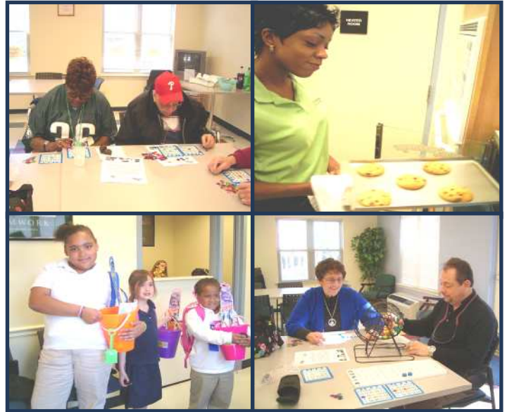
The Greens at Pine Hill residents enjoy Bingo; staff prepares cookies for residents and prospective residents; while the coloring contest winners proudly display their prizes

During the month of May, they had a coloring contest for all the children in the community. The children were very excited about the prizes they had won and look forward to participating in the next one. We received very colorful posters and enjoyed working with the children.