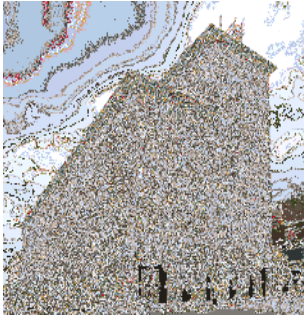
Broad Street Bank Apartments located in downtown Trenton, NJ

Oxford Heritage Manor - Property has a rural setting and is a senior community with 32 units and is located in Oxford, NJ.