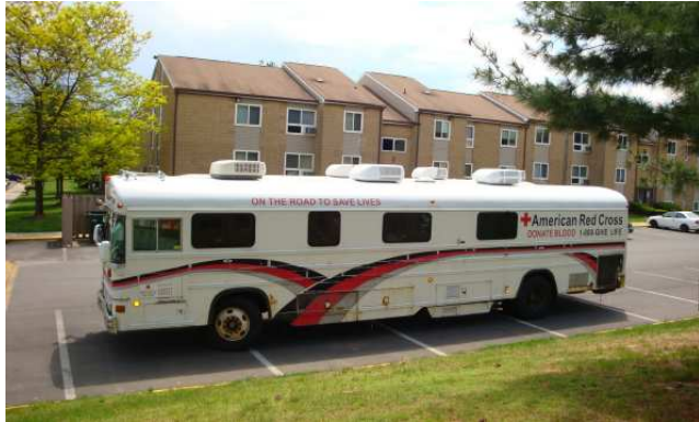
The American Red Cross Mobil Unit at Eagle Ridge's Best Practice Event in May 2010.

On Tuesday, May 4, 2010 Eagle Ridge hosted our CRM Best Practice Event. The subject for this year's event was a Blood Drive co-hosted by the American Red Cross. Along with hosting the Blood Drive, clothing and household items were also donated from our residents. These items were distributed to a local Woman's Shelter.