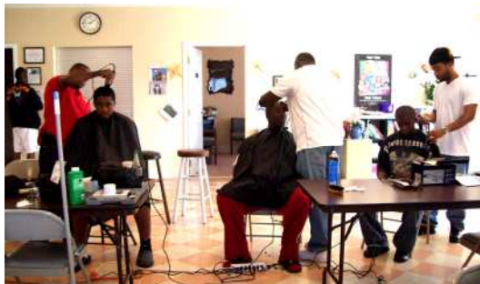
Residents participate in the Free Hair Cut Program