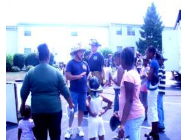
Rolling Hills residents receive instructions on fire prevention and safety from local firefighters.

Each household that participated in all of safety trainings, were entered into a raffle for a $50.00 gift card, $25.00 gift card, and a food basket. Afterward the residents and volunteers enjoyed a picnic lunch and refreshing Rita's Water Ice.