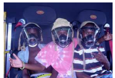
Children at Rolling Hills enjoy getting first hand experience in using firefighter's equipment and the inside of the fire truck.