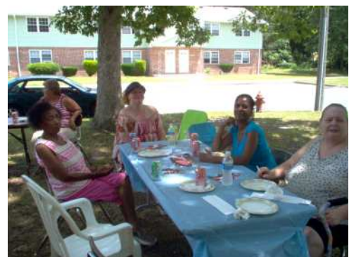
Woodbine Manor residents participate in the Annual Fire Drill and later enjoy the property's annual picnic