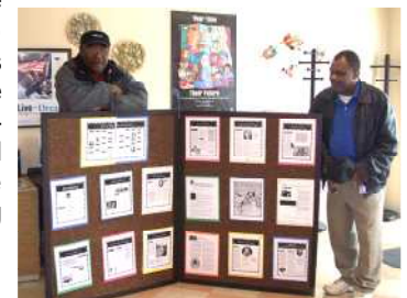
Residents participate in celebrating Black History Month at Newport Harbour

says they are very proud of all of our Neighborhood Network programs and that they have lots of programs planned in the coming months.