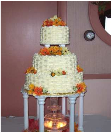
A lovely anniversary cake decorated in fall colors was enjoyed by all of the celebration attendees

all residents and guests to and from the event.