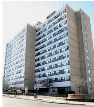
Luther Arms Senior Apartments located in Trenton, NJ

Opportunities Towers II - Located in Philadelphia and connected to Opportunities Towers for Aging. The 100%