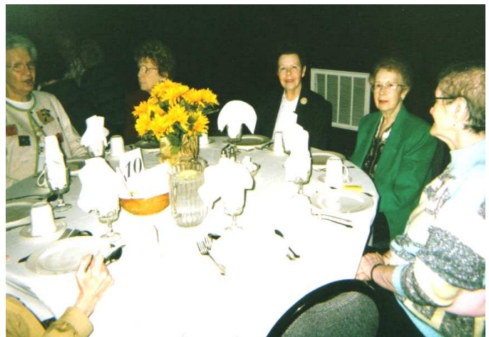
Residents of Lincoln Towers enjoy the property's 30th Anniversary banquet at Masser's Banquet Hall on October 17, 2009.

Happy 30th Anniversary to Lincoln Towers!