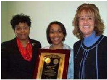
In November 2009 the Village at Lakeview Neighborhood Network Community Center achieved Model classification.

The program is not only for adults. Younger community members and residents are also benefiting.