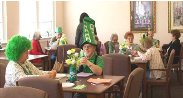
Green is the color and leprechauns and shamrocks abound as Hopewell's residents celebrate St. Patty's Day

Hopewell is an active and lively senior community.