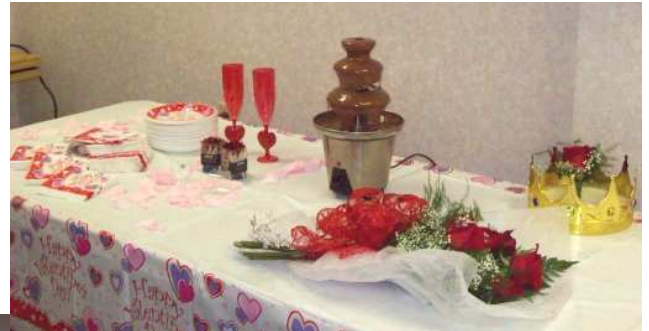
Festive decorations and treats set the mood for Lincoln Tower's annual St. Valentine's Day celebration

As with most of Lincoln Tower's monthly events, approximately 80 residents were in attendance, and as usual, a fun time was had by all.