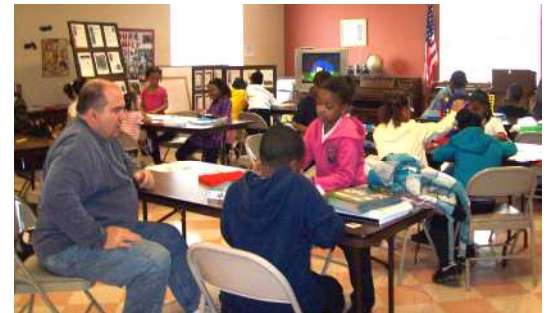
Children receive tutoring in the weekly after school program at Newport Harbour