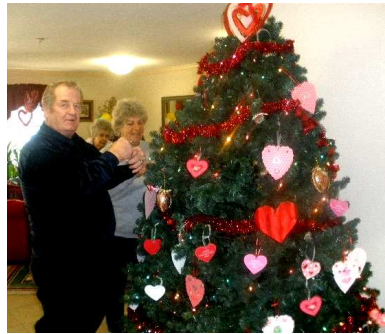
Hopewell residents decorate their Valentine's Day Tree in the lobby area