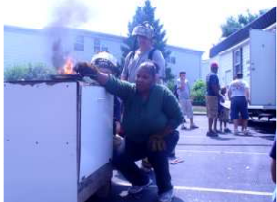
Under the watchful supervision of the Sanatoga Fire Company, Rolling Hills' residents practice putting out a simulated kitchen fire

In addition to the fire safety lessons, a police officer from the Lower Pottsgrove Police Department, demonstrated and quizzed the residents on bicycle safety.