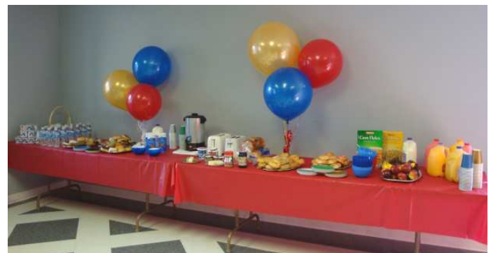
Refreshments provided by Eagle Ridge for the residents who attended the Grand Opening of their new Neighborhood Network Center

Snacks and refreshments were provided by Eagle Ridge for the enjoyment of the residents.